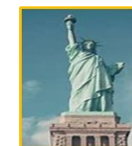
Statue of Liberty