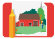
Simple City Resources

Do you know your username and password to use MiniMash and Purplemash?