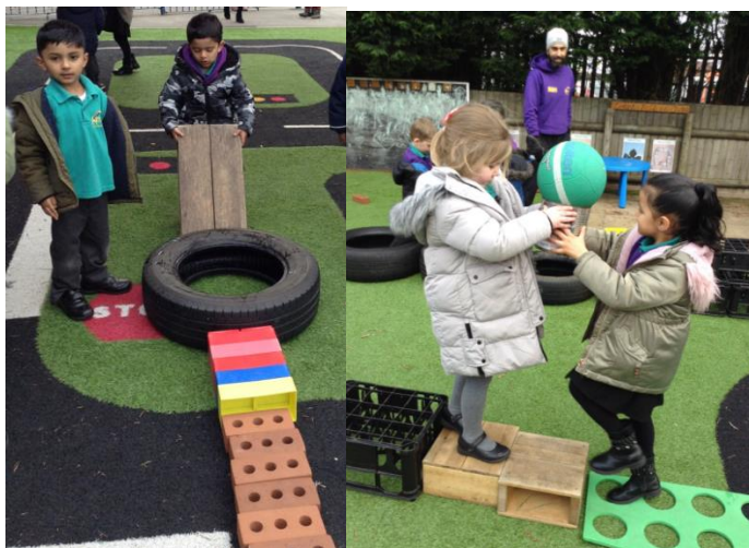
Reception Commando Joe